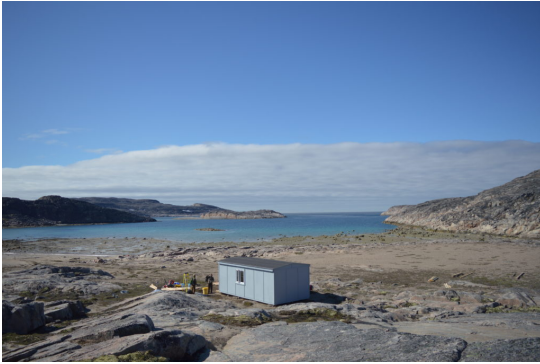
View of Mill Island Research Cabin.

A small (288 square foot) cabin with two rooms. The main room (12x16ft) has bunks that can sleep up to eight people and a desk for office work. The porch/mudroom (12x8ft) has some shelving for storage. Canvas tents are used for kitchen facilities and storage. Freshwater collected from a nearby stream is used for cooking and drinking.